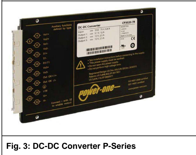
Fig. 3: DC-DC Converter P-Series