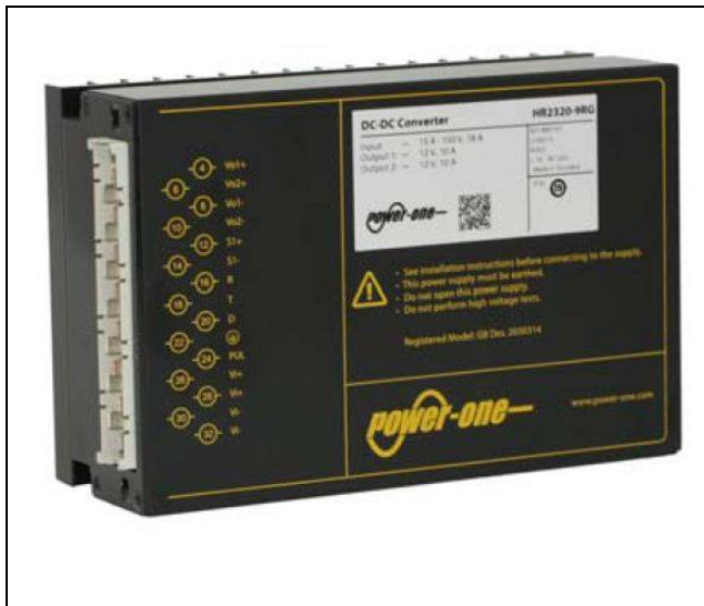
Fig. 5: DC-DC Converter R-Series