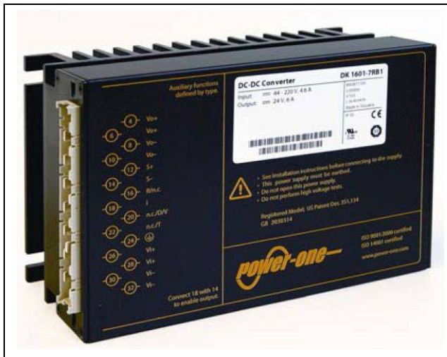
Fig. 1: DC-DC Converter K-Series