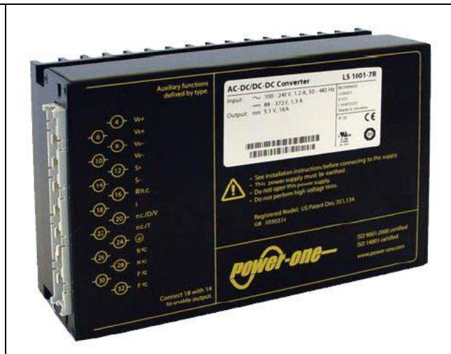
Fig. 2: AC-DC / DC-DC Converter S-Series