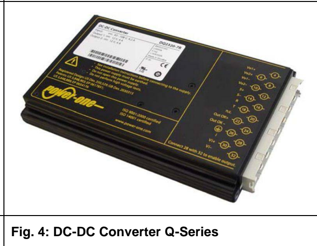
Fig. 4: DC-DC Converter Q-Series